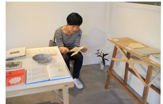
Independent Researches and Rubin's Vase 2017 installation location: Shibuya, Tokyo, Japan