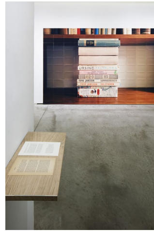
(above) installation view of the text and the image

A work with a short essay and an image, reflecting the distances created by age, nationality and values, where I projected life paths on the layers of books. There collection of small things create a bigger entity, and it is made to “age” as we all do.