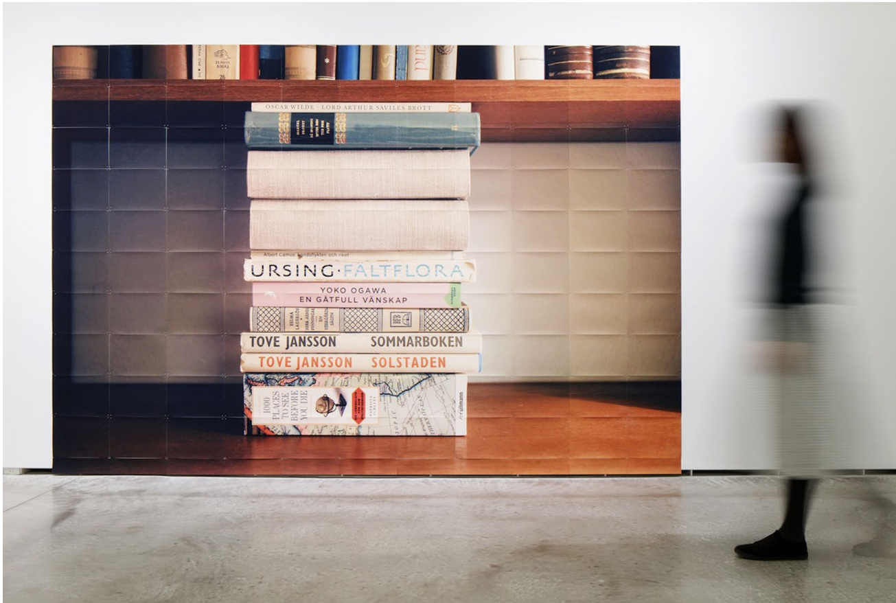
(below) installation view of the image part with an audience walking by

It is a work of art consisting of a short essay and an image, which reflects the distances created by age, nationality and values. I projected life paths on the layers of the books, and observed the meeting points of the seemingly distant things.